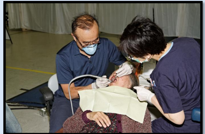
Volunteers and patients at the Church on the Queensway